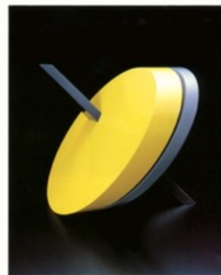
All Parts: August 2, 1982 Medium: All Parts: 100% Polymer Color: 100% White Dimensions: 100% 100%